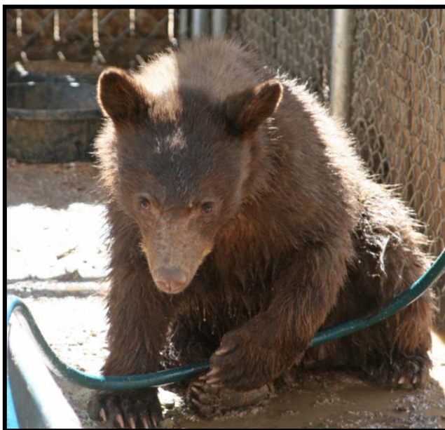
Redondo 170 lbs