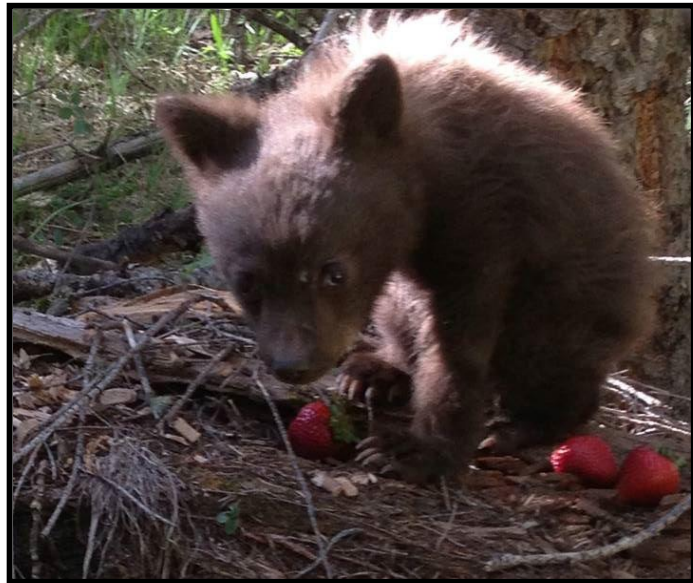
Redondo 5 lbs.

After that it was easy as Redondo put on weight and played with his best friend Sandia. Physically Redondo was fine but he didn't develop the healthy fear of man or the aggressive behavior to survive in the wild. It looked like Redondo was headed for a zoo until one day two weeks ago a man with a paint ball gun showed up at CWR.